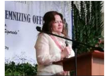
Hon. Mayor Cristina C. Diaz of San Mateo City, Rizal