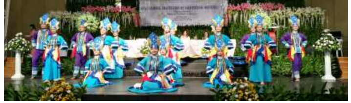
Intermission from PSA RSSO 10 during the opening ceremonies

The Mayor also added that "Kapag narehistro sa puso at isipan ng bawat Pilipino na siya ay may dakilang pamilya at magulang, tiyak rerehistro ang isang magandang kinabukasan."