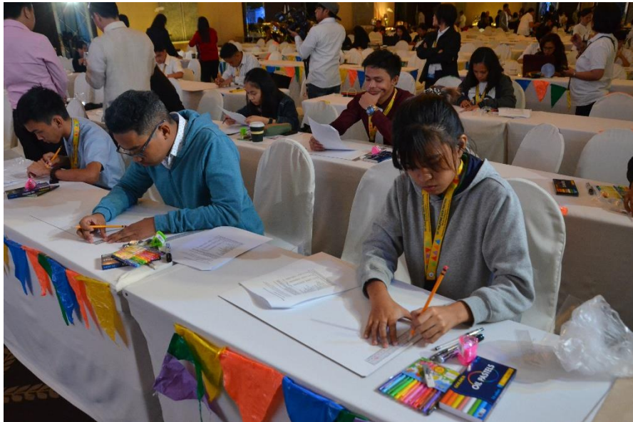
Photo 7. Student participants during the Data Cartooning contest