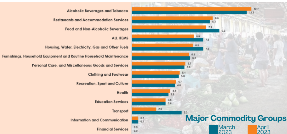
Major Commodity Groups