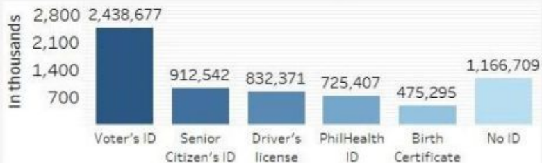
Figure 2: Types of available IDs among registrants (cumulative) 5