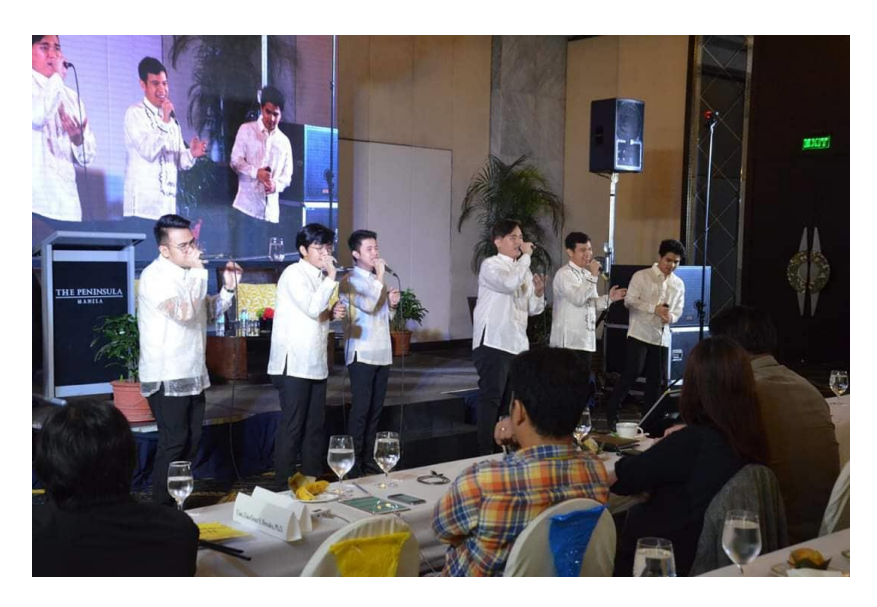
Photo 12. A cappella group PhiSix performing during the Plenary Sessions of the PH Data Fest.