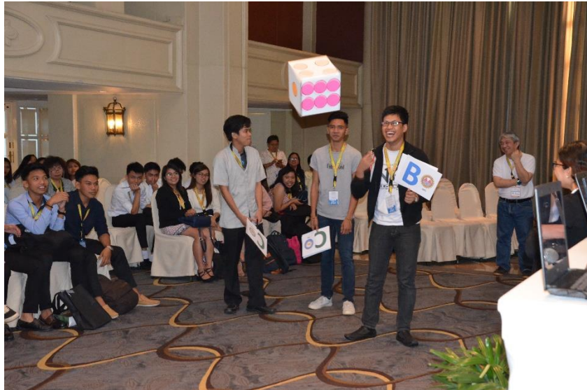
Photo 5. Participating students at the game of Stats and Ladders taking turns in rolling the dice