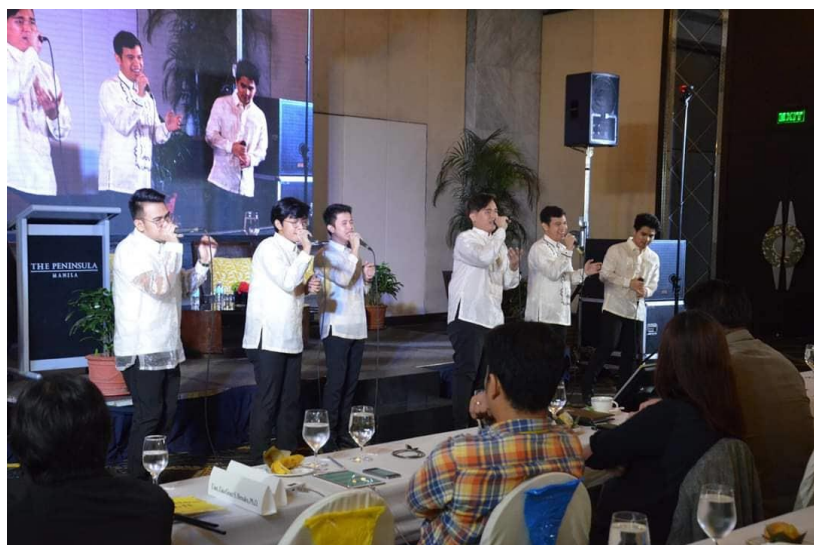
Photo 12. A cappella group PhiSix performing during the Plenary Sessions of the PH Data Fest.