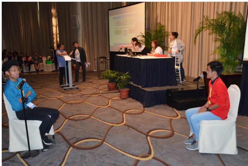
Photo 6. Students from Don Mariano Marcos Memorial State University – South La Union Campus taking their turn at the Stat Genius game