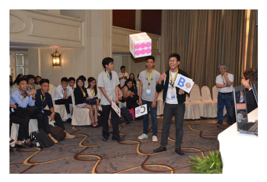
Photo 5. Participating students at the game of Stats and Ladders taking turns in rolling the dice