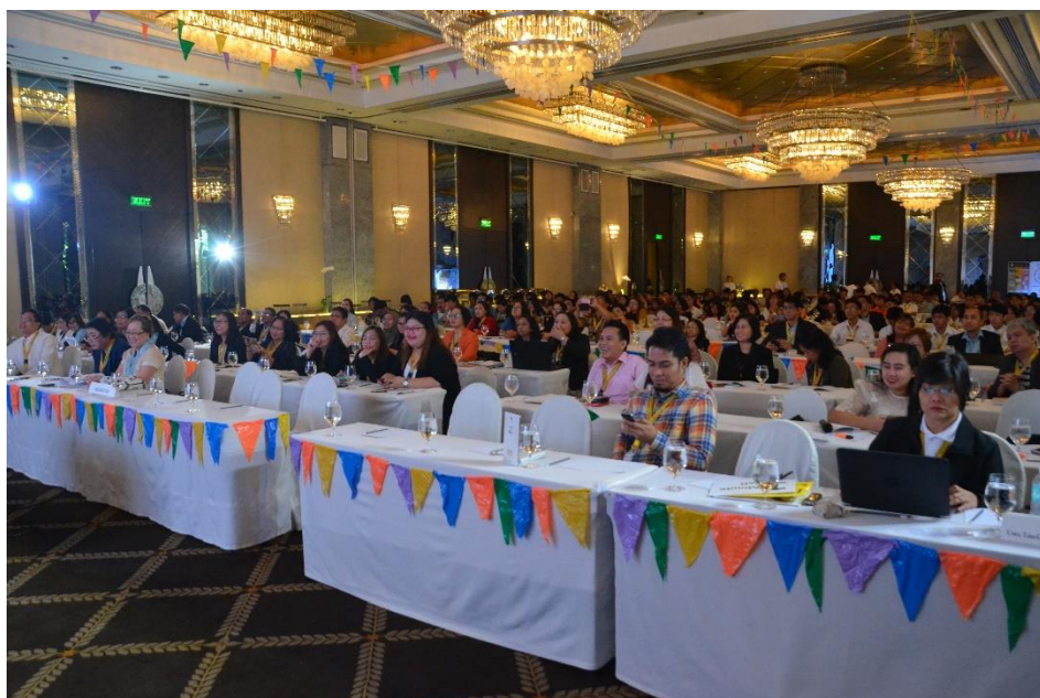
Photo 2. PH Data Fest participants at the Rigodon Ballroom during the Plenary Session 1