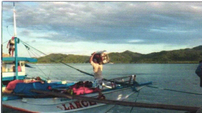
A local loads a Registration Kit on a boat as PhilSys personnel prepare for a six-hour trip to Calayan Island, Cagayan to conduct registration activities.

Notwithstanding the hour-long hikes and rivers that had to be crossed, the initiative brought the total registrations in the area to 35,943 as of 30 April 2022.