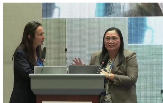
ANS Grande joins onsite to serve as a panelist for a session on statelessness statistics.