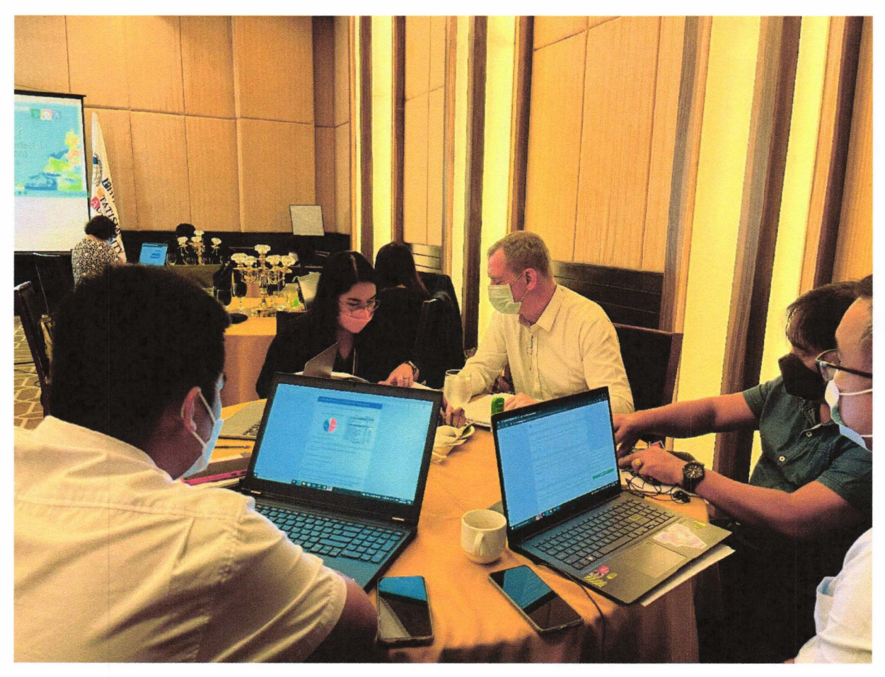
Figure 1. Stakeholders from City of Tacloban answer the online assessment form during the conduct of the Consultation Workshop with Stakeholders and Validation on PPA Benchmark Estimates for Eastern Visayas held last 09 June 2022 at Summit Hotel, Tacloban City