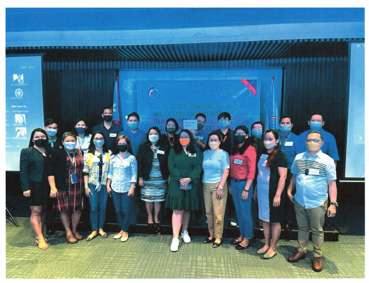
Figure 5. Stakeholders from Davao del Norte pose for a group photo during the Consultation Workshop with Stakeholders and Validation of the PPA Preliminary Benchmark Estimates in Davao Region conducted last 23 June 2022 at SMX Convention Center Davao, Davao City.