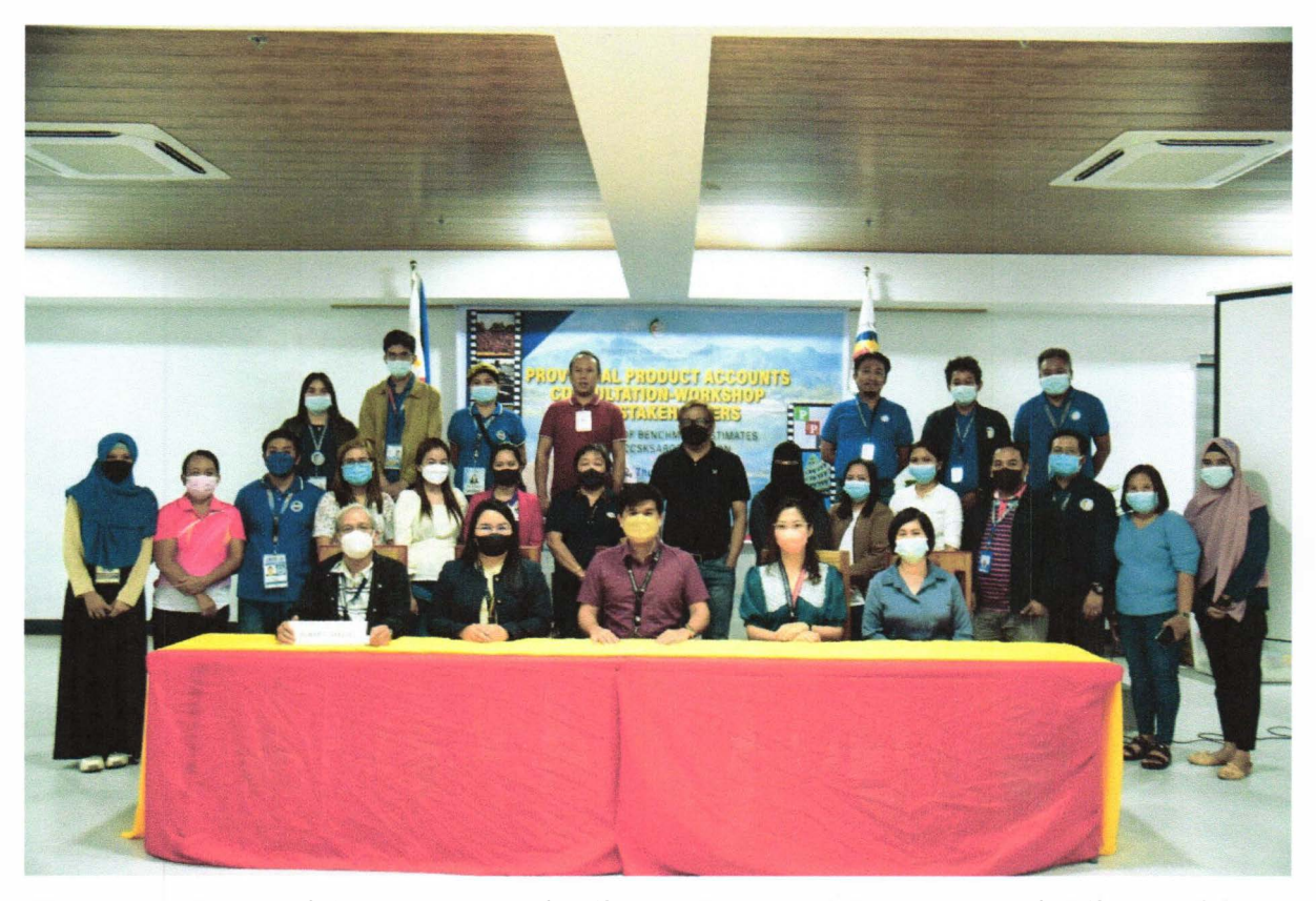
Figure 3. PPA Focal from the Central Office, SOCCSKSARGEN Regional Office, and South Cotabato Provincial Office poses for a group photo during the Consultation Workshop with Stakeholders and Validation of PPA Preliminary Benchmark Estimates for SOCCSKSARGEN Region last 16 June 2022 at Mapa Hall, PSA-SOCCSKSARGEN Regional Office, Koronadal City. The activity was conducted in a hybrid set-up with other provinces gathering their stakeholders in different venues.