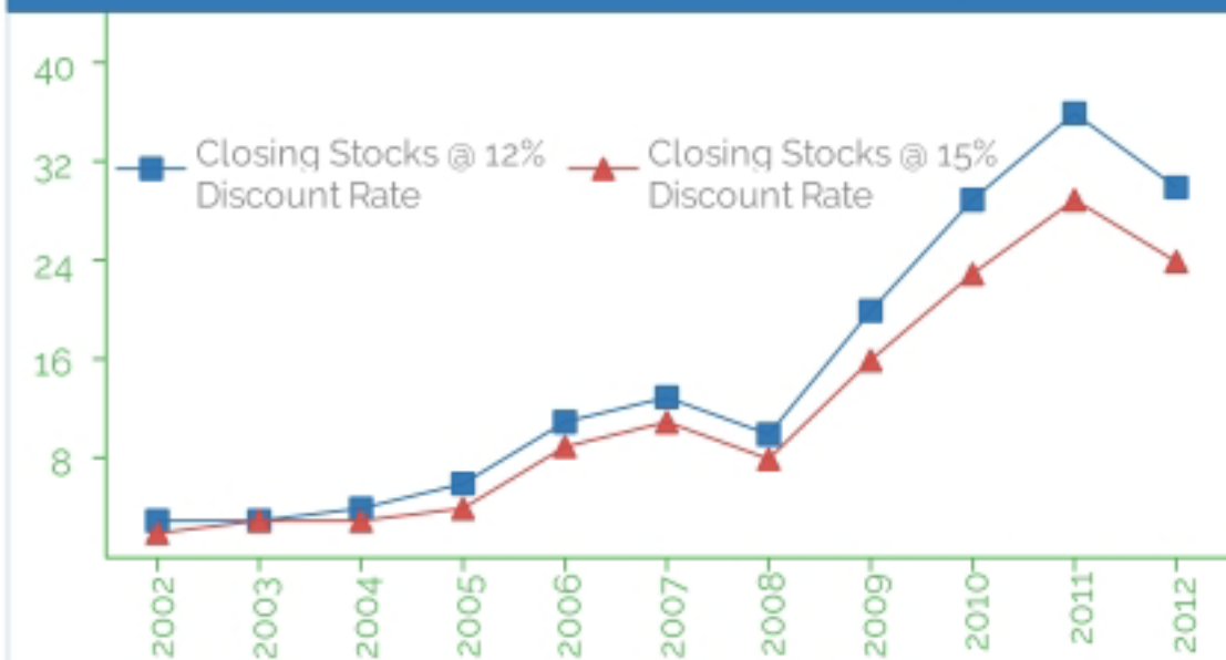
Copper: Class A - Monetary Accounts in Millions of Philippine Pesos

Upward reappraisals were only accounted in 2004 for Class C and 2012 for Class B