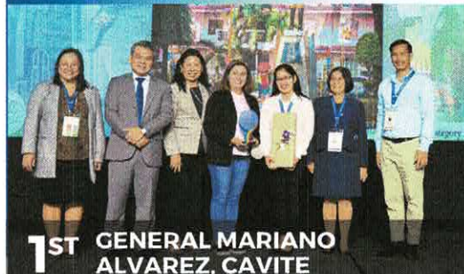
1 ST GENERAL MARIANO ALVAREZ, CAVITE