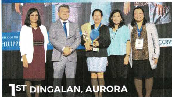
1 ST DINGALAN, AURORA