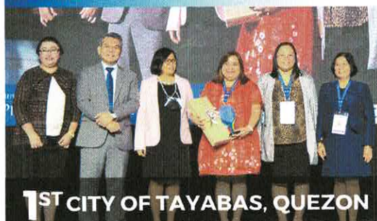
1 ST CITY OF TAYABAS, QUEZON