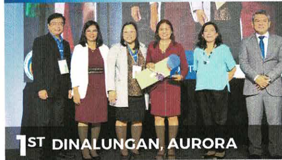
1 ST DINALUNGAN, AURORA