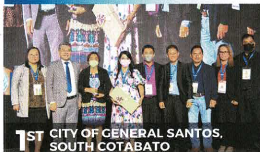
1 ST CITY OF GENERAL SANTOS, SOUTH COTABATO