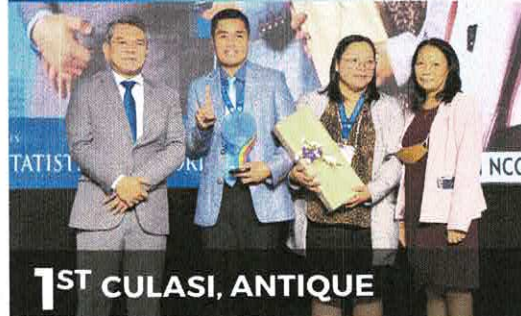
1 ST CULASI, ANTIQUE