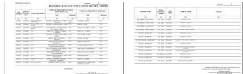
Generated electronic Out of Town Register of Court Decree / Order