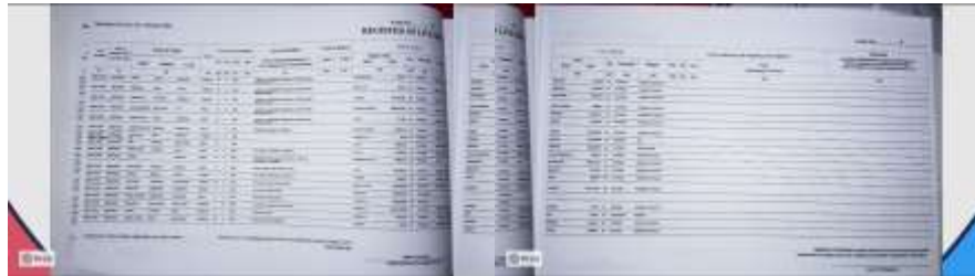
Printed electronic Register of Live Birth