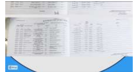
Printed electronic Register of Court Decree / Order