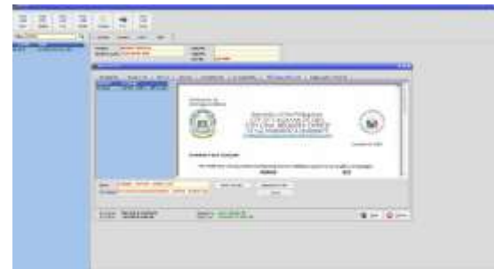
Uploading Client's digitized Sendong into the electronic Sendong Certification