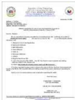
New Endorsement Letter for Out of Town Registration of COLB