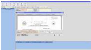
Uploading Client's digitized Court Decree / Order into the electronic Register of Court Decree / Order