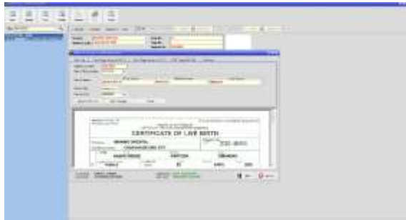
Uploading Client's digitized COLB into the electronic Register of Live Birth