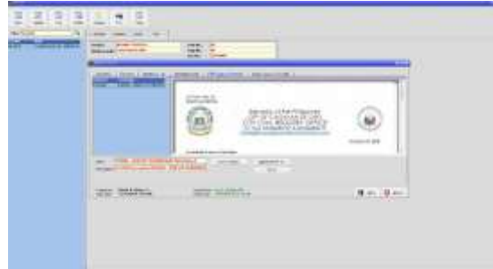
Uploading Client's digitized LCR Form 2A into the electronic Form 2A Certification