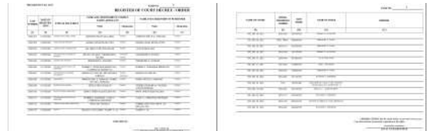
Generated electronic Register of Court Decree / Order