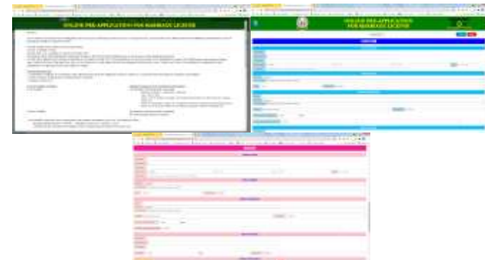
New Website for Pre-Application for Marriage License