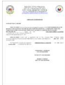
New Certificate of Registration