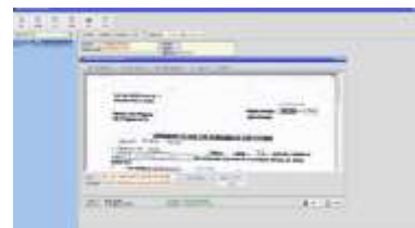
Uploading Client's digitized Legal Instrument into the electronic Register of Legal Instrument