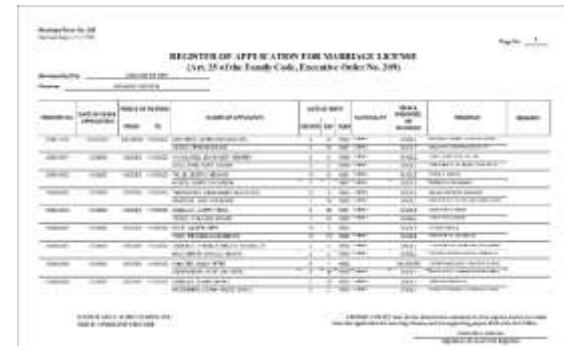
Generated electronic Register of Application for Marriage License