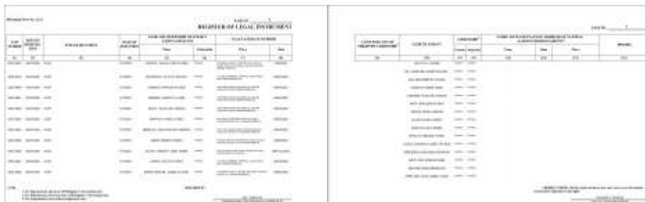
Generated electronic Register of Legal Instrument