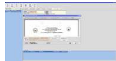
Uploading Client's digitized Out of Town Court Decree / Order into the electronic Out of Town Register of Court Decree / Order