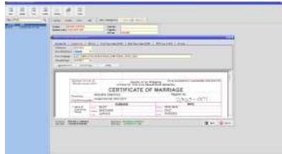
Uploading Client's digitized COM into the electronic Register of Marriages