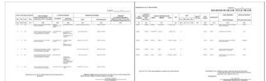
Generated electronic Register of Death / Fetal Death