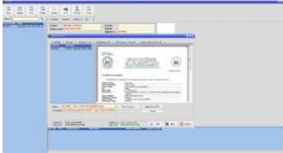
Uploading Client's digitized LCR Form 1A into the electronic Form 1A Certification