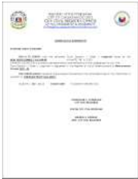
New Certificate of Authenticity