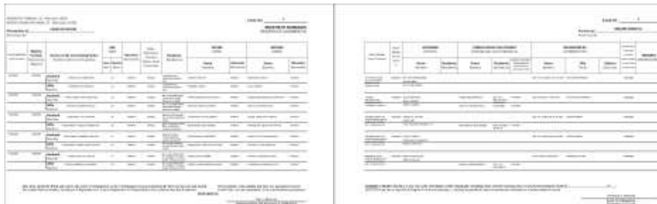
Generated electronic Register of Marriages