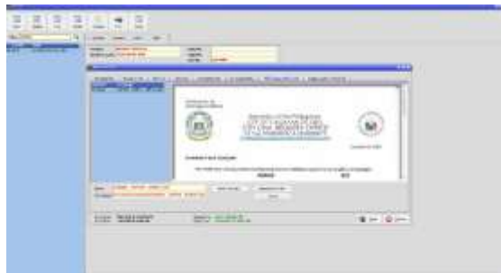
Uploading Client's digitized Pre-war into the electronic Pre-war Certification