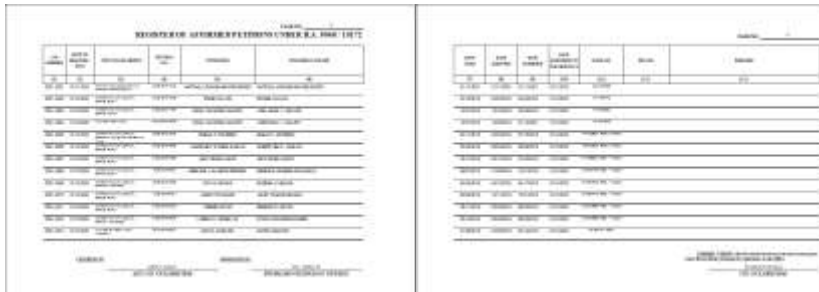
Generated electronic Register of Affirmed Petitions Under R.A. 9048 / 10172