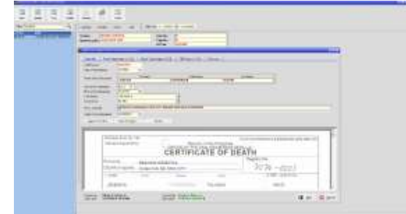
Uploading Client's digitized COD/COFD into the electronic Register of Death