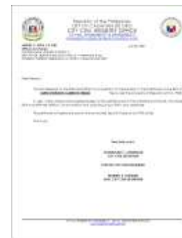
New Transmittal Summary Letter for APURA