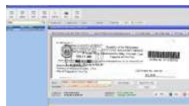
Uploading Client's digitized Affirmed Petition into the electronic Register of Affirmed Petitions Under R.A. 9048 / 10172