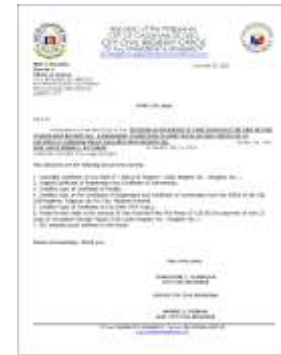
New Transmittal Summary Letter and its detail for the local petition for CDLI