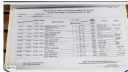
Printed electronic Register of Application for Marriage License