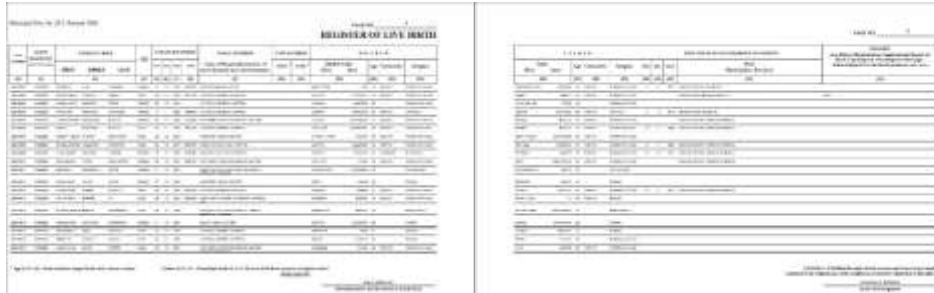
Generated electronic Register of Live Birth