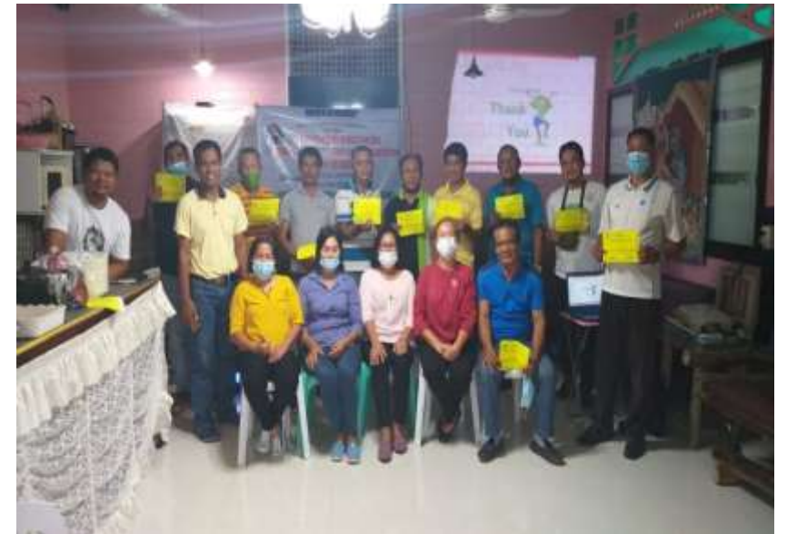
Solemnizing officers with PSA PO and MCR