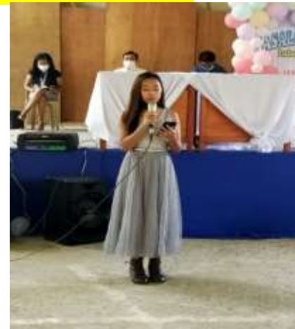
Rendering of Christian songs during the wedding ceremony