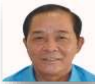
HON. EGIDIO D. CADUNGON JR. Municipal Mayor