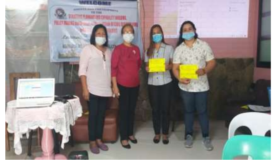
MRC with hospital staff