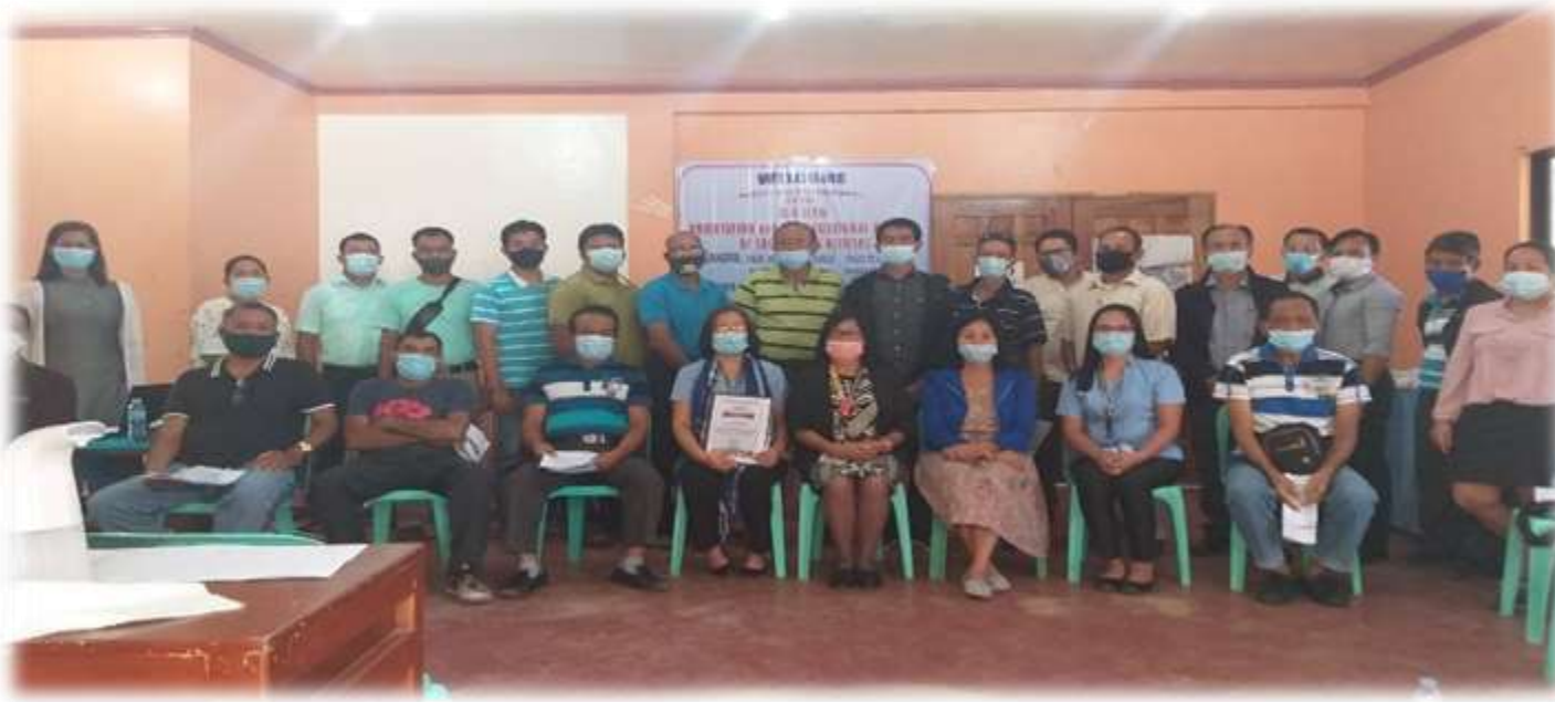
Officers of ASOA with PSA PO personnel