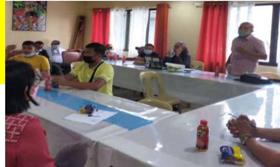
MRC with Punong Barangays & Secretaries