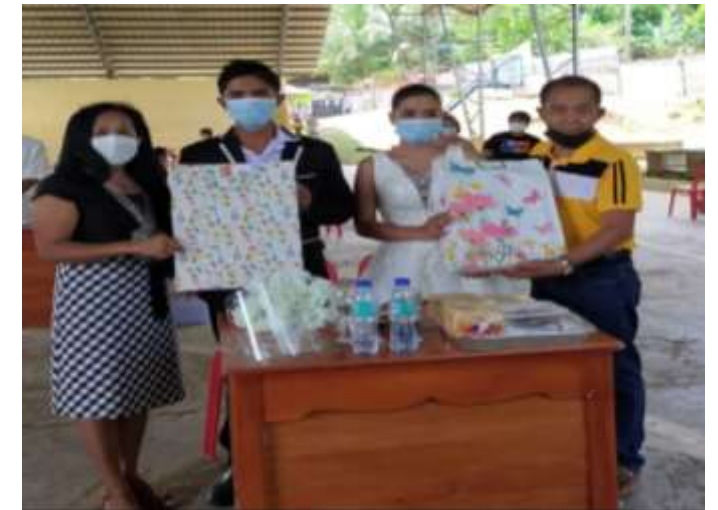
LCRO solicited from LGU Officials wedding gifts to newly weds in every Kasalan sa Barangay