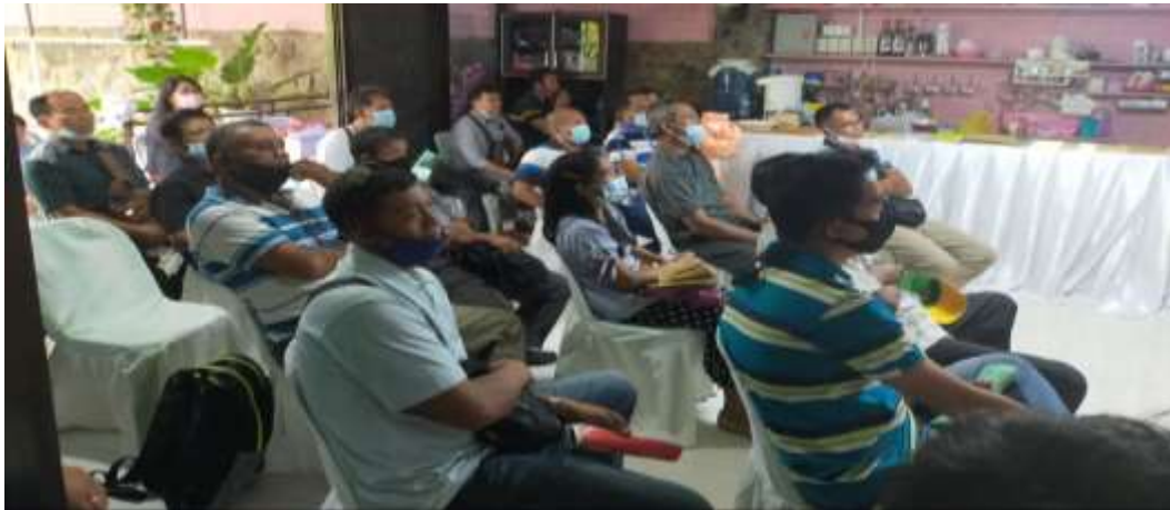
Barangay Captains and Solemnizing Officers attending the Seminar-Workshop on Strategic Planning to Strengthen Civil Registration