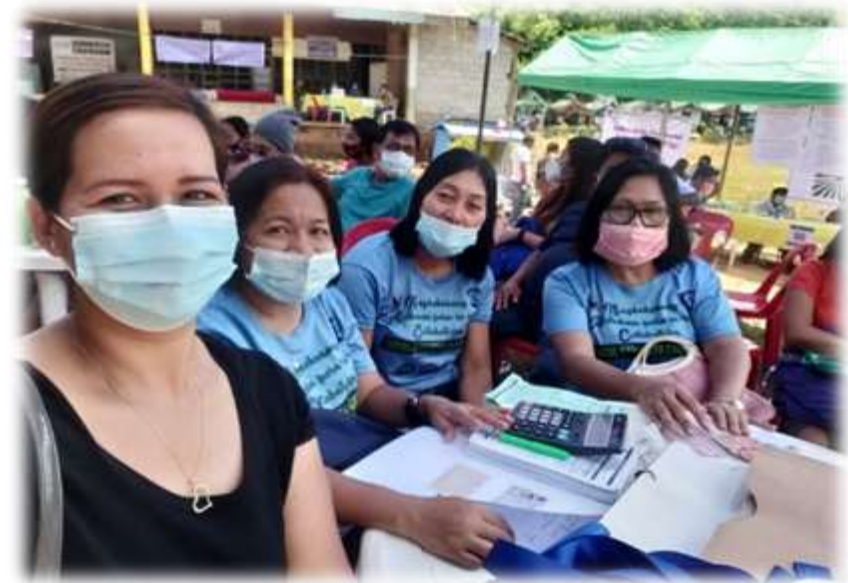
MCR and staff during the year-end performance review