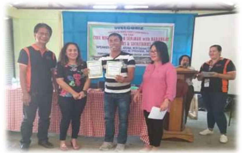
Awarding of certificates to participants by the PSA PO