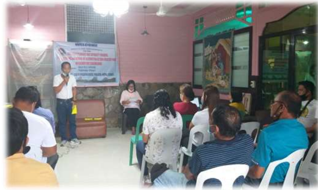
Hon. Mayor E. D. Cadungon, Jr. giving an inspirational message to the participants in support of the LCR activities