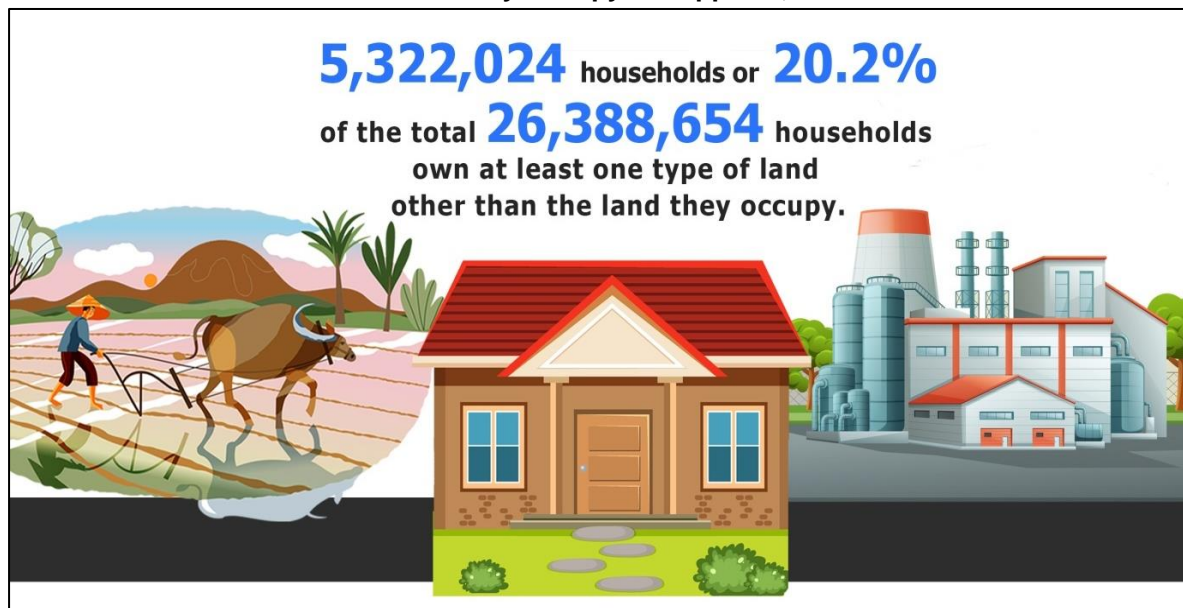
Figure 1. Households that Own Land/s Other Than the Land They Occupy: Philippines, 2020