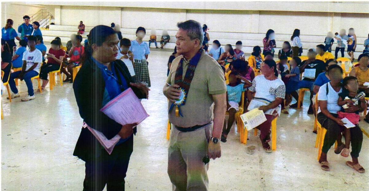
PSA Usec. Mapa visits an FDS in San Benito, Surigao del Norte where National ID authentication services have been offered.

As of 08 May 2024, a total of 1,010,464 4Ps beneficiaries have been authenticated in various Family Development Sessions (FDS) conducted nationwide.