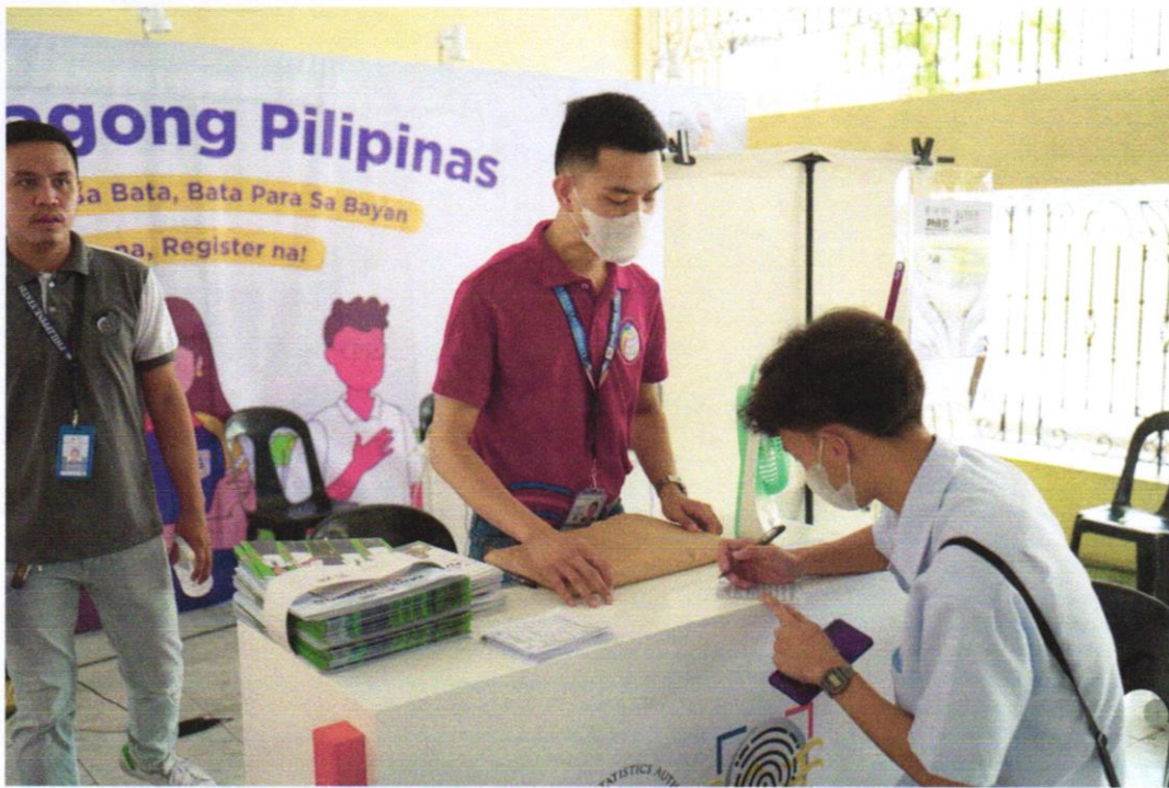
A student registers to PhilSys during the school-based registration activity in Pampanga High School.

Minors aged five (5) and above accompanied by parents or guardians may also register at any registration center. To make registration easier for students and their parents, PSA field offices are also conducting school-based registration activities.