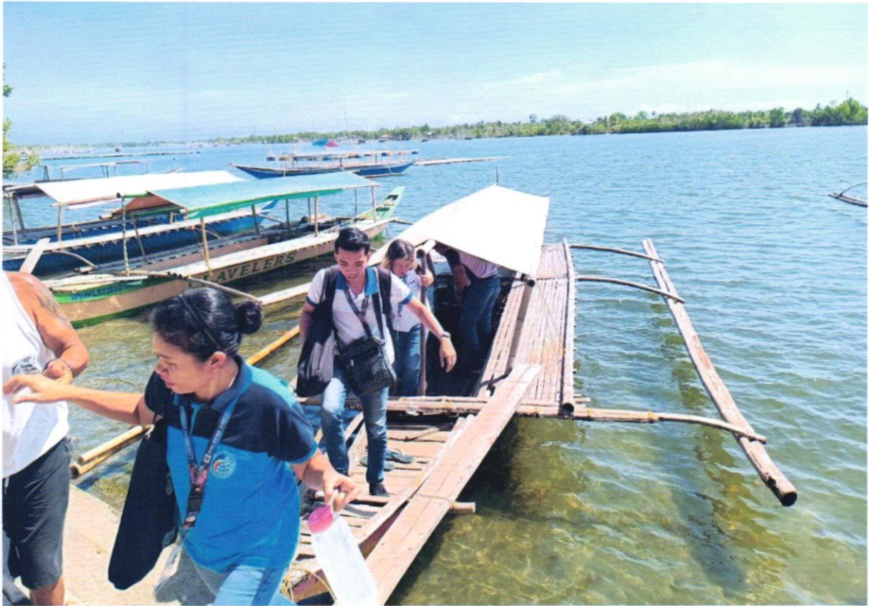
Personnel from the PSA alights a boat upon reaching Pinamuk-an Island in Aklan to bring National ID authentication services for 4Ps beneficiaries.

Meanwhile, other National ID services will continue to be offered to 4Ps beneficiaries during FDS, including registration and printed ePhilID issuance.