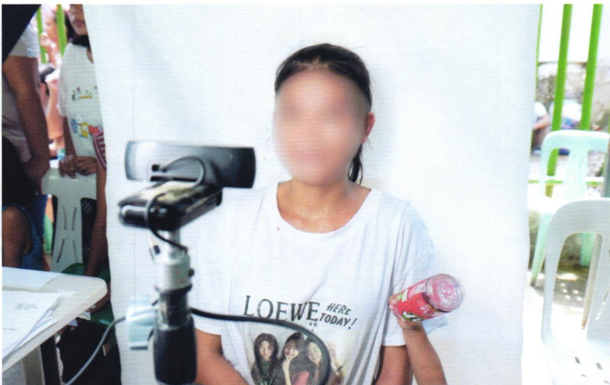
An attendee of an FDS in Masbate City, Masbate registers to the National ID.

Meanwhile, other National ID services will continue to be offered to 4Ps beneficiaries during FDS, including registration and printed ePhilID issuance.