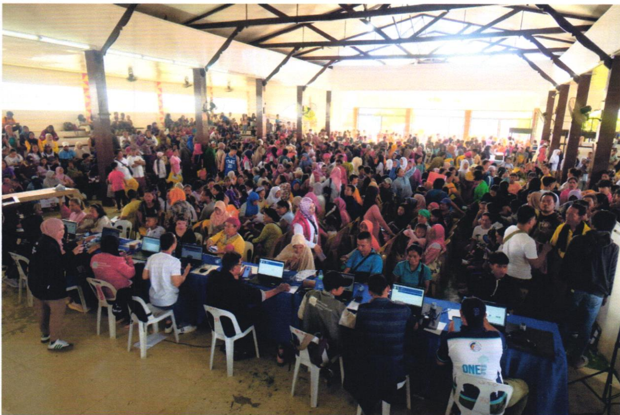
Beneficiaries of 4Ps in Lamitan City, Basilan line up for authentication through the National ID at an FDS.

At an FDS in Lamitan City, Basilan, PSA personnel set up multiple counters to efficiently authenticate all 4Ps beneficiaries present.