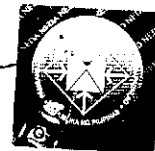
ERNESTO M. PERNIA Secretary of Socioeconomic Planning National Economic Development Authority PSA Board Chairperson