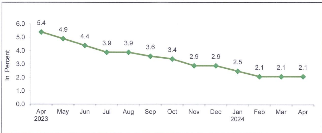
Figure 1. Growth Rates of the GRPI in NCR, All Items April 2023 – April 2024 (2012=100)

Source: Philippine Statistics Authority, Retail Price Survey of Selected Commodities for the Generation of Retail Price Index