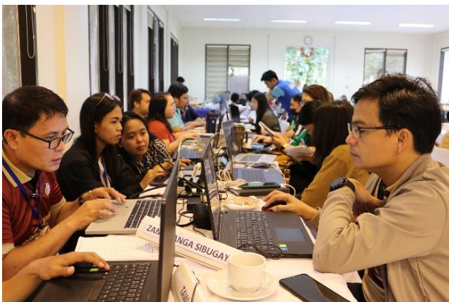
The survey group processing the trade data during the workshop proper of Cluster 2 to generate a non-benchmark PPA estimates for 2019 and 2022.

The activity was spearheaded and facilitated by the Subnational Economic Accounts Division, Production Accounts Division, and Expenditure and Integrated Accounts Division of the Macroeconomic Accounts Service, under the Sectoral Statistics Office.