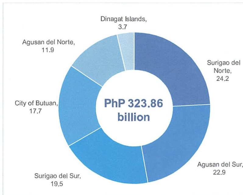
Figure 1. Share of Provinces and HUC to Caraga's GDP, At Constant 2018 Prices: 2022 (In Percent)

The PPA results showed that in 2022, Surigao del Norte had the largest share to Caraga's economy, accounting for 24.2 percent. Agusan del Sur followed with a share of 22.9 percent. Meanwhile, Surigao del Sur, City of Butuan, Agusan del Norte, and Dinagat Islands had shares of 19.5 percent, 17.7 percent, 11.9 percent, and 3.7 percent, respectively. (Figure 1)